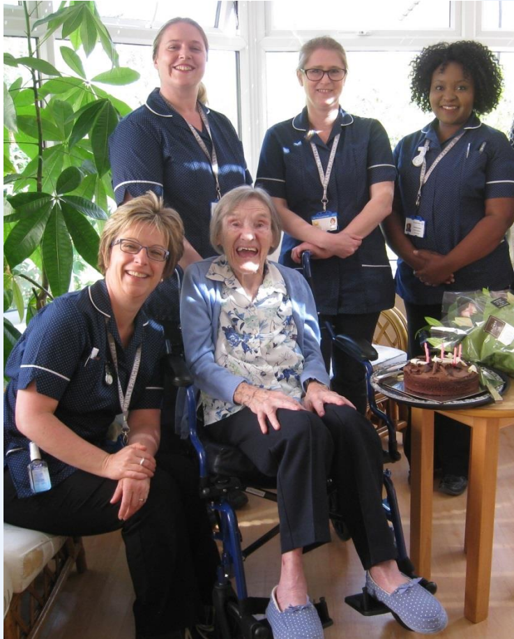
Dolly – Frailty Practitioner Service