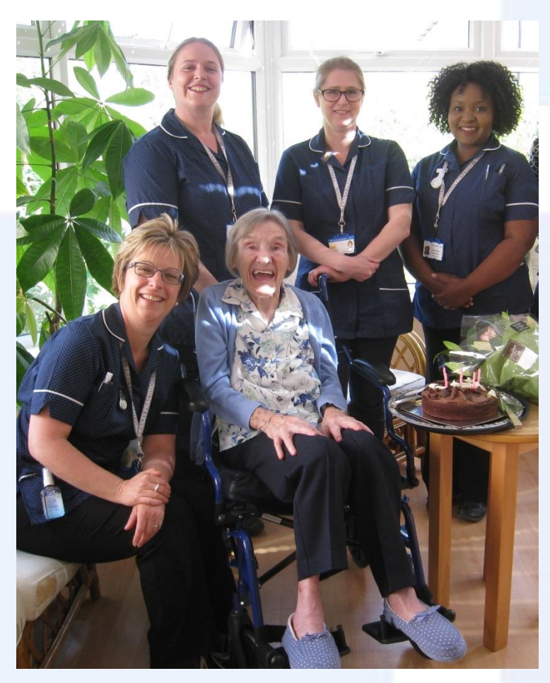
Dolly – Frailty Practitioner Service